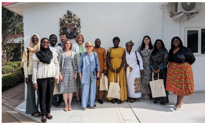
The CPA UK Delegation meeting with civil society organisations at the British High Commission, Banjul.

CPA UK is grateful for the support of the National Assembly, WFD and the British High Commission to The Gambia that made this visit possible.