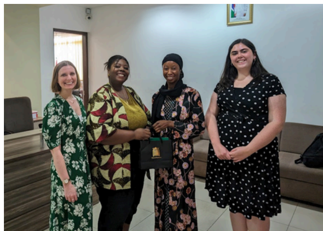
The CPA UK Delegation meeting with the clerk of the Gender Committee in the National Assembly.