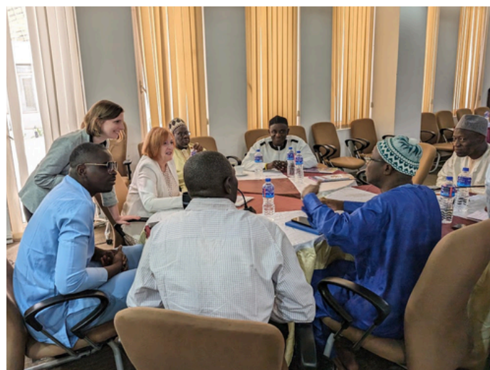
The CPA UK Delegation meeting with groups of National Assembly Members elected for the first time in 2022.

During this delegation visit, the British High Commission to The Gambia organised a event for members of the committee and civil society to connect and strengthen their relationships. CPA UK will continue to support this work, in collaboration with the Westminster Foundation for Democracy and the British High Commission.