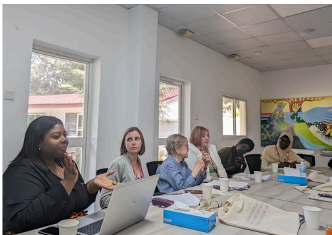
The CPA UK Delegation at meeting with civil society organisations.

The 2022 election saw a decline in the number of women represented in the National Assembly, from six to five. Three female members are directly elected, with a further two nominated by the President. The National Assembly has a target of 30% female representation, but at present it is only 8.6%. Attempts have been made to address this, including a draft bill designed to create more reserved seats for women. In 2022, of the 246 candidates in the 2022 elections, only 19 were women. There have been attempts from political parties to encourage more women to stand for election, given that female candidates are often very popular in local communities.