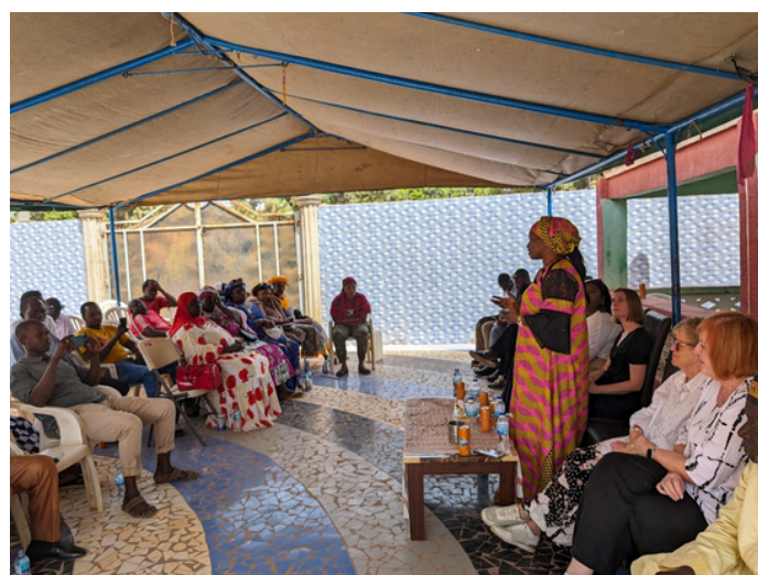
The CPA UK Delegation meeting with constituents of a National Assembly member.