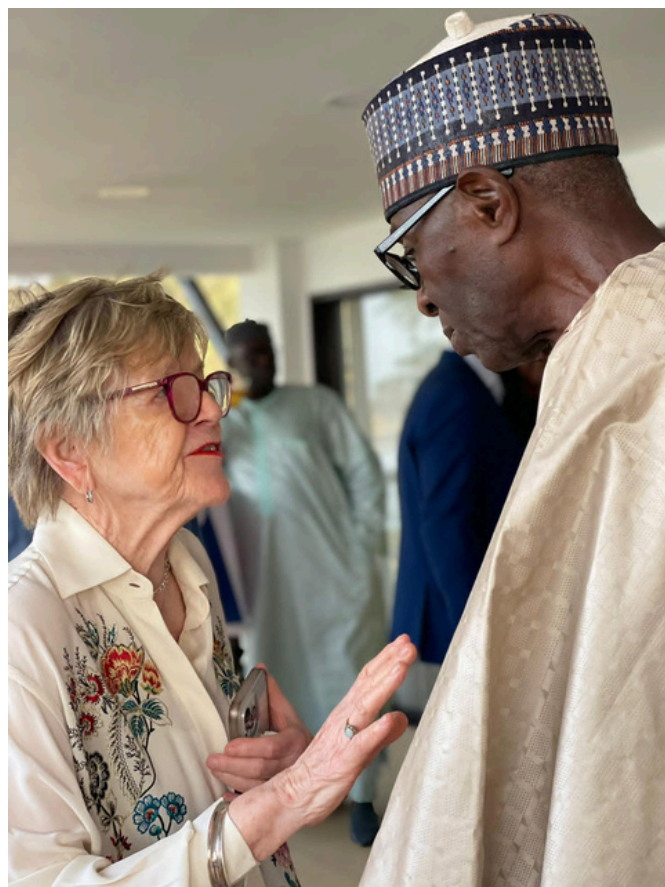
The Speaker of the National Assembly of The Gambia speaking with Baroness Armstrong at an event hosted by the British High Commission.

Over the past three years, CPA UK has partnered closely with the National Assembly of The Gambia and the Westminster Foundation for Democracy. From April 2022, CPA UK has facilitated many engagements under a Memorandums of Understanding with these partners. CPA UK looks forward to continuing partnership with the National Assembly of the Gambia with upcoming programmes likely to focus on supporting committee clerks and women in parliament.