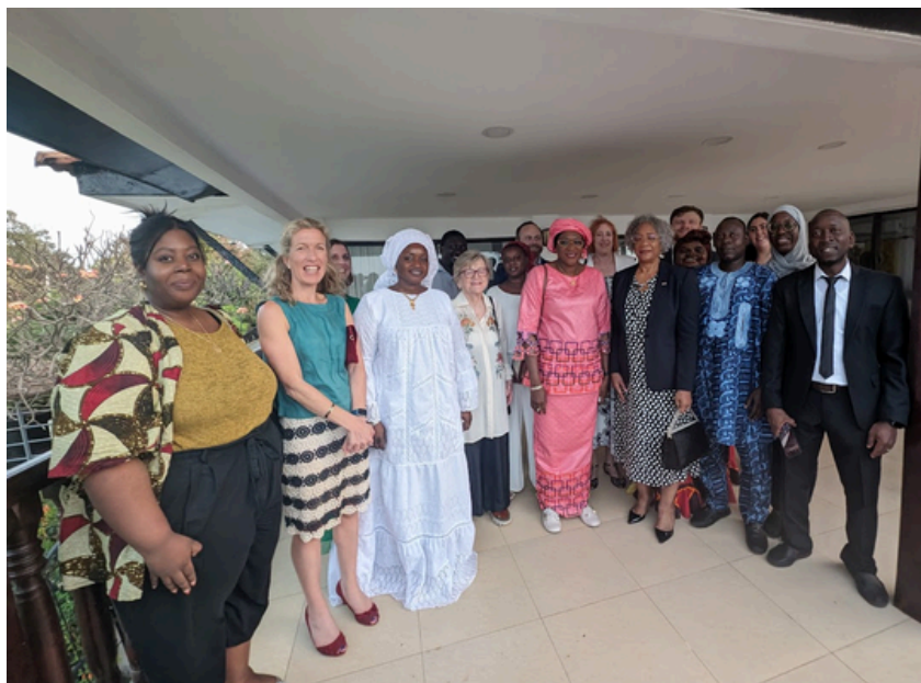
The CPA UK Delegation at areception organised by the British High Commission.