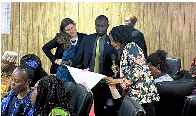
Participants sharing their contribution following a brainstorming activity.