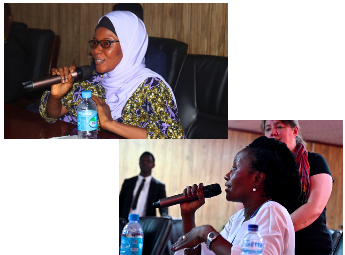
Sierra Leone delegates sharing their contributions during the seminar.

Female participants shared that the Sierra Leone Parliament has not been physically designed for the inclusion of women, with the very limited sanitary facilities for women. Female members shared the challenge of waiting to be called to speak in the well of parliament and that there had been debates in which no woman had spoken.