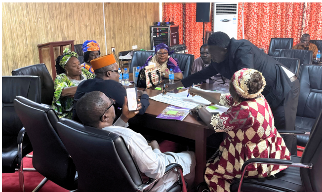
Sierra Leonean MPs working on a break-out activity in the seminar.

There continues to be an appetite for future engagement, with women in parliament and cross-party collaboration continuing as areas of interest. In March 2024, several Sierra Leonean MPs are participating in CPA UK's annual Westminster Seminar conference in London. We look forward to future bilateral programmes, likely after the UK's next General Election.