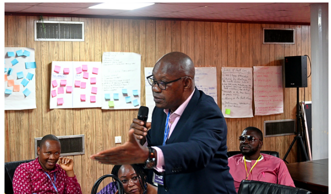
A participant sharing his contribution to the group, following a brainstorming activity.