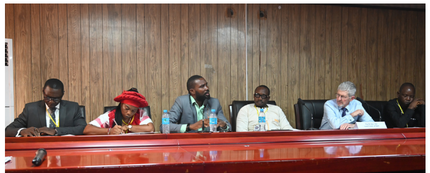
A panel of Sierra Leonean and UK delegates at the event opening.