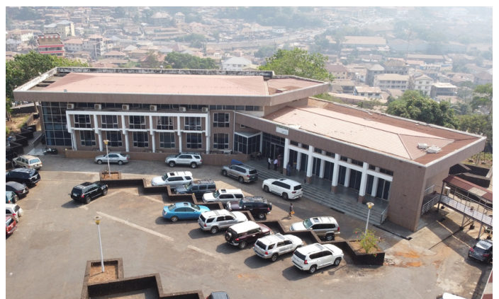
Sierra Leone Parliament buildings.

[2] https://nightwatchnewspaper.com/apc-mps-sworn-in-today-what-the-future-holds/