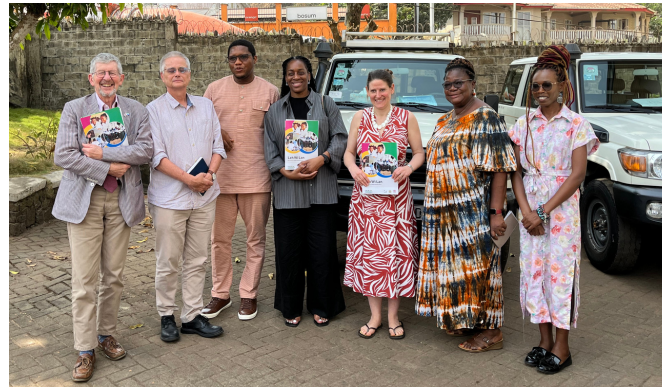
The CPA UK Delegation at the Leh Wi Lan Headquarters, an education programme that has received support from the UK Government.

The expectations of the constituents in the UK and Sierra Leone on the responsibilities of their MPs