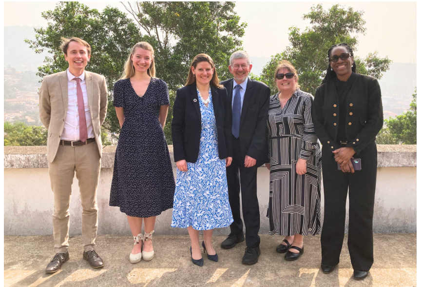
The CPA UK Delegation outside the Parliament of Sierra Leone.

Speaker of Parliament: Rt. Hon. Dr. Abass Bundu