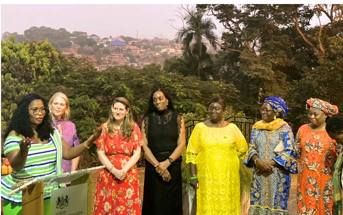
Minister Dr Isata Mahoi addresses the Women's Caucus of Sierra Leone during a reception hosted by the British High Commissioner.

Following Dr Mahoi's appointment, the Women's Caucus of Sierra Leone has been re-established, with the aim to create a non-partisan forum to identify common challenges facing female parliamentarians and to collaboratively offer solutions and support. Female law and policy makers from both local to national level have been invited to join the forum.