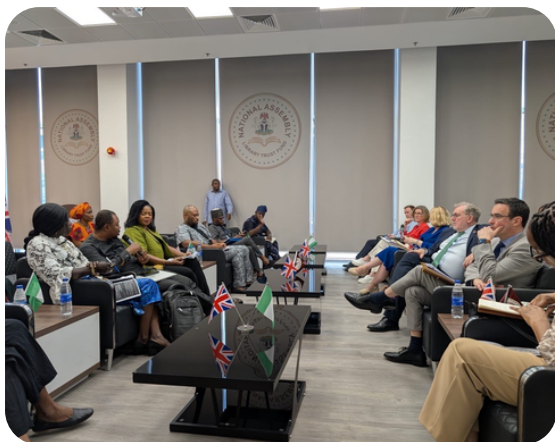
A roundtable with the UK delegation and representatives from GBV civil society organisations.

The UK delegation appreciated the opportunity to meet with female Nigerian parliamentarians to discuss the broader barriers to women's political participation. Key challenges raised included election-related harassment and the lack of support from political parties.