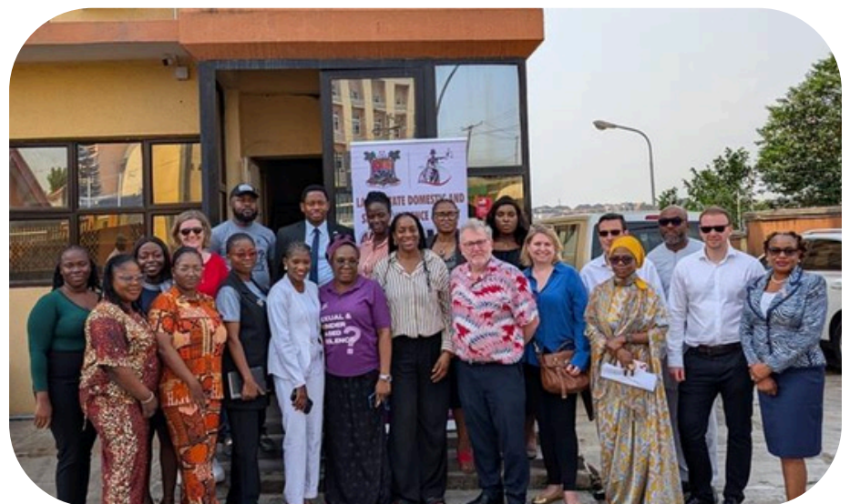
The UK delegation pictured outside the Lagos State Domestic and Sexual Violence Agency.