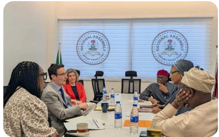
Members of the UK delegation meeting with various committee chairs from the National Assembly.

During meetings with chairs of healthcare committees, participants discussed the structure of healthcare institutions in both Nigeria and the UK. There are key institutional similarities, including the role of local doctors and the management of hospital care.