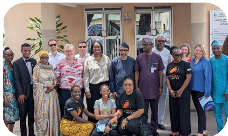
CPA UK delegation meet colleagues from the Mirabel Centre.

They also learned about the importance of cross-agency collaboration, prompt response mechanisms, and the role that state institutions can play in bridging gaps between survivors and access to justice. These discussions resonated with delegation leader, Kate Osamor MP, who reflected on her participation at the Commonwealth Women Parliamentarians' meeting on gender-based violence looking at the role of state and national level response.