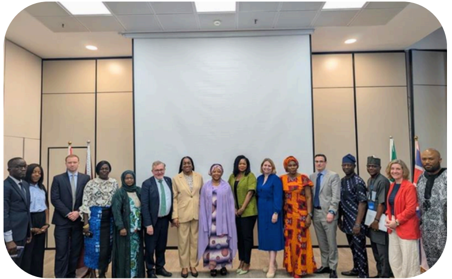
The UK delegation and representatives from GBV civil society organisations.

In 2024, CPA UK facilitated a visit to the National Assembly of Nigeria as an opportunity to rebuild and strengthen parliamentary ties. Designed specifically for UK clerks and officials, the visit aimed to enhance collaboration and share best practices on committee working and parliamentary standards and behaviour. Through discussions and exchanges, UK clerks and officials engaged with their Nigerian counterparts to explore ways to improve parliamentary processes and governance.