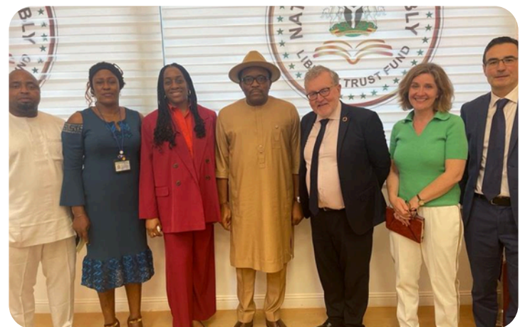
Members of the UK delegation meeting with various committee chairs from the National Assembly.

The delegation, alongside members of the National Assembly, explored common challenges faced by public healthcare systems, such as resource constraints, workforce shortages, and disparities in access to care. These discussions emphasised the pressing need for increased investment in healthcare infrastructure and workforce development. Strengthening these areas is essential not only for improving healthcare delivery and outcomes in Nigeria and the UK but also for addressing global health challenges more effectively.