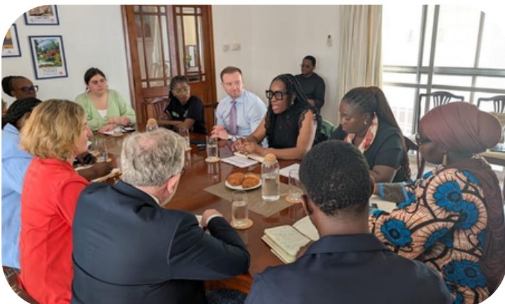
UK delegation meeting with Lagos based NGOs and CSOs Gender Based Violence at State Level.