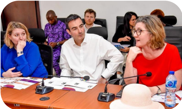
(left to right): Dame Karen Bradley MP, Lord Oates and Dr Beccy Cooper MP at the Lagos State University Teaching Hospital to better understand how to support the Mirabel Centre.

The CPA UK delegation also met with staff from the Mirabel Centre, a non-governmental organisation and Nigeria's first sexual assault referral centre. Located within the Lagos State University Teaching Hospital, the Mirabel Centre provides direct free medical care and psychosocial support to survivors of rape and sexual violence, including men, women, and children. The delegation noted that the Mirabel Centre's work in supporting survivors of GBV serves as a strong example of effective state-level initiatives. They highlighted that such initiatives could help inform and influence the development of national legislation.