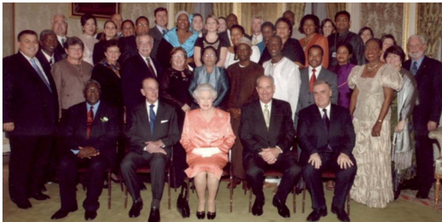
Delegates attending the 56th Westminster Seminar, in the presence of Her Majesty The Queen and HRH The Duke of Edinburgh, Commonwealth Day Reception, Marlborough House, 10 March 2007

"Of the many ties linking this family of nations not the least is that system of parliamentary government which is common to us all".