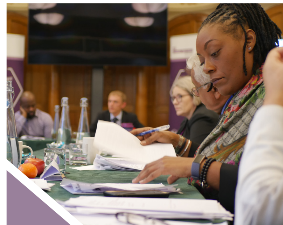
Committee Inquiry Exercise at the London Forum Dec 2019

The Forum enabled both participants and facilitators to identify the many ways in which the UK and OTs can continue to work together to ensure long-lasting and sustained impact beyond the initial phase of the project.