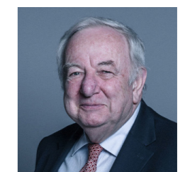
Rt Hon. Lord Foulkes of Cumnock Chair, Project Board