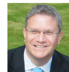
Andrew Rosindell MP Vice Chair, Project Board