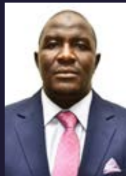
HON ASUMAN BASALIRWA

Hon Asuman Basalirwa is the Member of Parliament for Bugiri Municipality, belonging to the opposition party JEEMA. As a lawyer/Advocate, he has served on the Committee on Legal and Parliamentary Affairs and the Committee on Rules, Privileges and Discipline. Before August 2018, he served as a company lawyer and partner.