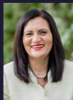
DR PARMJEET PARMAR MP

Dr Parmjeet Parmar is the National List MP based in Mt Roskill, Opposition Spokesperson for Research, Science and Innovation, and Associate Spokesperson for Economic Development. She is also the Chair of the Education and Workforce Parliamentary Select Committee. In 2014, Dr Parmar became the first Indian born woman to become a Member of Parliament. Prior to entering Parliament, Dr Parmar worked as a scientist, businesswoman, broadcaster and community advocate. Naturally community-minded, Dr Parmar has also served as a Families Commissioner, a Community Representative on the Film and Video Labelling Body, and as Chair of an association helping victims of domestic violence.