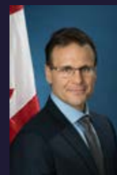
SENATOR LEO HOUSAKOS

Hon Leo Housakos was appointed to the Senate of Canada in 2008. Following his election as Speaker pro tempore in 2014, he was named Speaker of the Senate by Prime Minister Harper in 2015. An avid student of Westminster Parliament and its procedures, serving as Speaker was one of his greatest honours. Recently, he also applied his passion for Westminster when he chaired a study on parliamentary privilege by the Senate's committee on Rules, Procedures and the Rights of Parliament. At dissolution of Canada's 42nd Parliament, Senator Housakos was also a member of the Senate's Committee on Foreign Affairs and International Trade. Previously, Senator Housakos was at the forefront of the Senate of Canada's recent modernization as Chair of Internal Economy. Prior to his appointment to the Senate of Canada, Mr. Housakos, a graduate of McGill University, enjoyed a successful career in business.