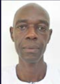
HON ASSAN TOURAY

Hon Assan Touray has been a National Assembly Member of the Republic of The Gambia since 2017. He is a youth activist and a politician.