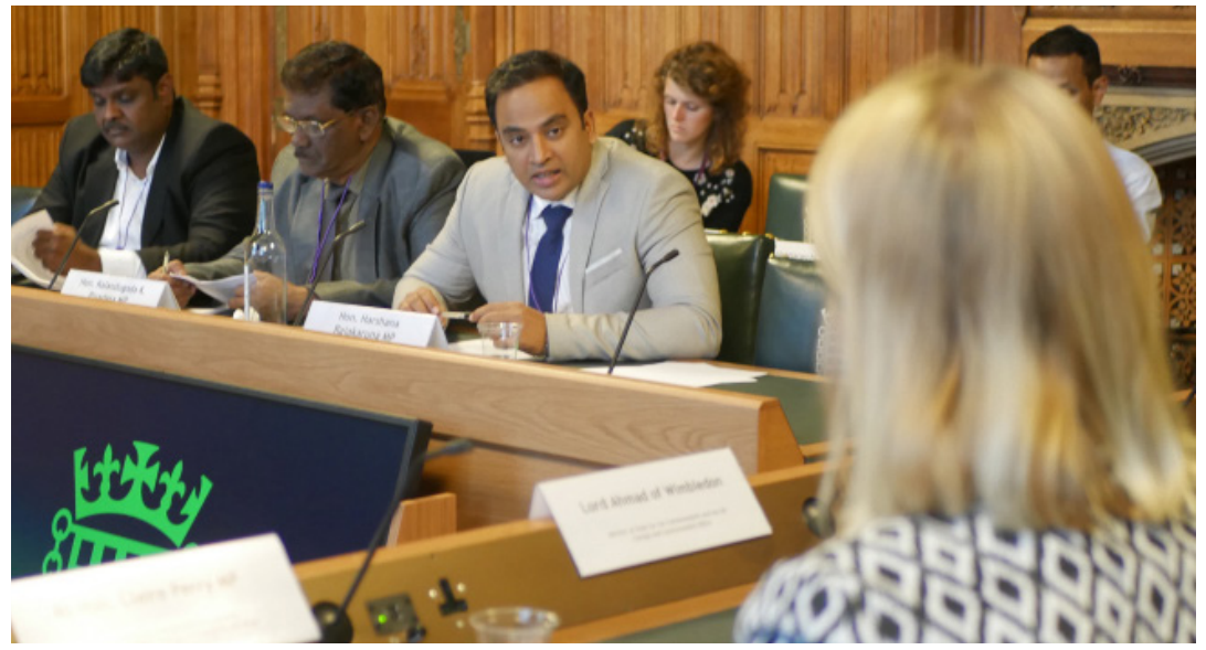
The delegation took part in a committee exercise based on the Environmental Audit Committee's Sustainable Seas inquiry

The delegation discussed the importance of creating a structure for questions, as otherwise it is hard to build crossparty consensus. Some information from witnesses needs to be redacted for privacy purposes.