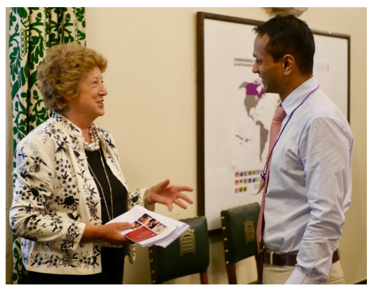
Baroness Anelay of St Johns met with the delegation to discuss effective strategies for questioning witnesses

collectively and are basing their recommendations on the same evidence. In the UK, when selecting witnesses, there are two main types of witnesses which committees are looking to collect evidence from during an inquiry: specialists looking to share information on a matter or issue, and witnesses with a particular argument. The sequence of interviewing witnesses is important – usually, witnesses with a particular argument give evidence last. Specialists sharing information are typically interviewed first, as their evidence may feed into questions for later witnesses. Whilst getting evidence from subject experts is important, it is also important to reach out to witnesses on the ground.