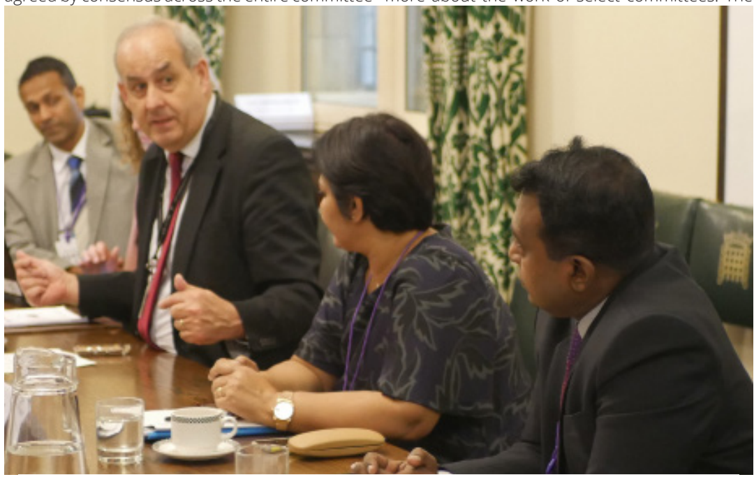
Rt Hon. David Hanson MP discussed Prime Minister's Questions with the delegation

before an inquiry is discussed publicly. In Sri delegation discussed the challenges of raising Lanka, committee reports can only be shared with awareness about the important work of select the public once they are tabled for debate in the committees to scrutinise government activity and Chamber. In both parliaments, usually committee policies. members do not comment on an inquiry if it is ongoing.