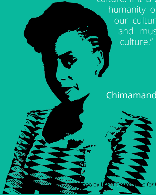
Chimamanda Ngozi Adichie

"I raise up my voice, not so I can shout but so that those without a voice can be heard...we cannot succeed when half of us are held back."