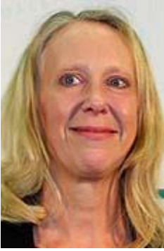
Liz McInnes MP