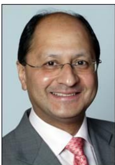
Shailesh Vara MP

Baroness Gale has an active involvement with charitable organisations, including that of President of the Royal British Legion Treherbert and District Branch, President of the National Association of Old Age Pensioners of Wales, Patron of Kidney Wales Foundation, and Patron of Bees for Development. She Co-Chairs the All Party Parliamentary Group on Parkinson's disease. She has a lifelong commitment to equality for women and campaigns to ensure there are more women in political and public life.