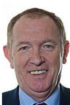
Rt Hon. Sir Kevin Barron MP

Between 2005 and 2010 David was Minister of State at Northern Ireland, the Ministry of Justice and the Home Office. David was Shadow Exchequer Secretary in 2010 and Shadow Policing Minister in 2011 and is currently Shadow Minister in the Foreign Office. David has served on the CPA UK Executive Committee and was elected Treasurer in 2015.