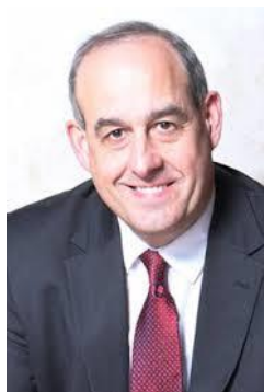
Rt Hon. David Hanson MP