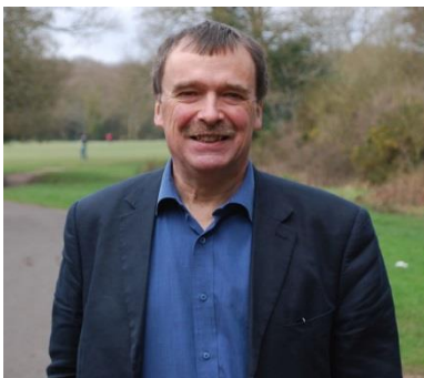
Dr Alan Whitehead MP