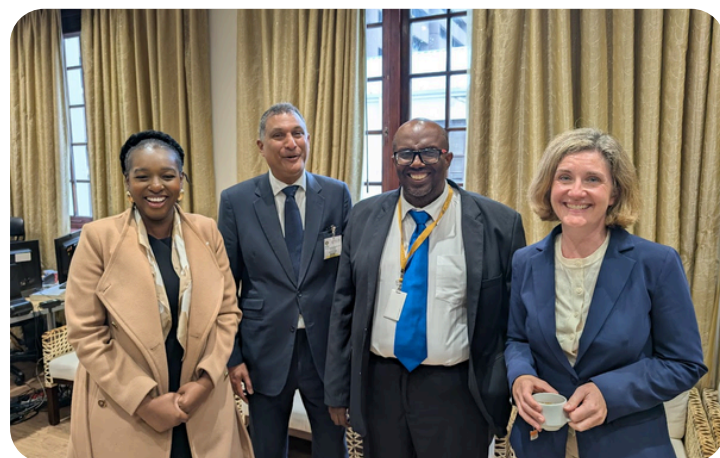
Members of the UK delegation meeting with South African Parliament Members

The visiting UK parliamentarians had a particular interest in global health and were keen to explore opportunities for further collaboration with South Africa in this area. On the first day of the visit, the British High Commission organised a visit to the Centre for Epidemic Research and Innovation (CERI), including their newly constructed Biomedical Research Institute.