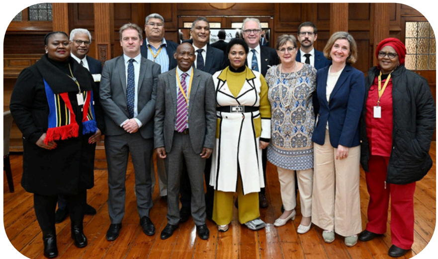
The UK delegation meeting South African National Assembly Members

COMMONWEALTH PARLIAMENTARY ASSOCIATION UK - CPA UK