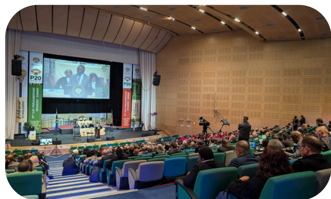
Viewing of Budget Reading to the National Assembly and National Council of Provinces

In June 2025, CPA UK helped to coordinate a meeting on health collaboration with South Africa in coordination with the International Development Committee. This meeting included representatives from CERl, the UK Health Security Agency and the Wellcome Sanger Institute. Following the meeting there is an ambition for these organisations to work more widely with Commonwealth countries on health collaboration.