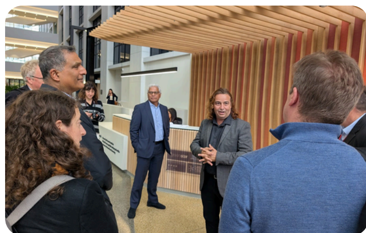
Members of the UK delegation on the tour of CERI