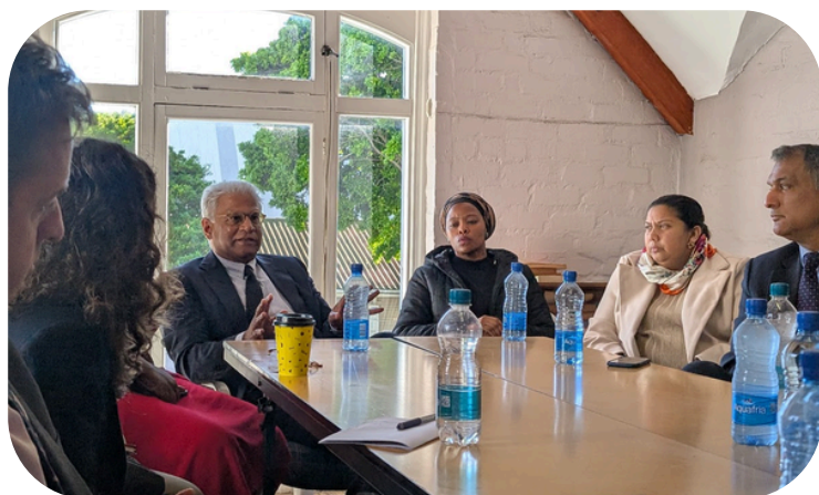
Roundtable meeting with Rape Crisis in Cape Town

As part of this visit, the British High Commission organised a roundtable meeting with the organisation Rape Crisis . This organisation has close to 50 years of experience in supporting survivors of rape on their road to recovery and justice, as well as advocating for policy change. The delegation had the opportunity to meet with colleagues working on psychosocial support, legal advice and policy advocacy.