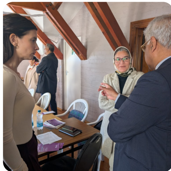
Roundtable Meeting with Rape Crisis in Cape Town

In both the UK and South Africa there is a high rate of collapsing prosecutions for survivors of sexual violence. For the few cases that reach court, survivors may be asked to face perpetrators. The group discussed the need for justice systems to be more survivor-led, with better provision for video evidence. The delegation was interested in the support Rape Crisis provides to survivors in navigating this court process and considering how these lessons could be implemented in the UK.