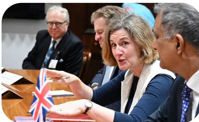
The UK delegation meets the Chairperson of the National Council of Provinces

Also in June, CPA UK arranged a meeting with the Western Cape Speaker and Leader of the Opposition to gain a stronger understanding of the work of provincial parliaments and how they interact with the national parliament. CPA UK hopes to welcome a delegation from the Parliament of South Africa to Westminster next year (2026) to continue the engagement. CPA UK will also continue to connect civil society organisations and parliamentarians on issues related to GBV in line with our strategy.