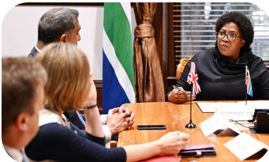
The UK delegation meeting the Chairperson of the National Council of Provinces

This visit reaffirmed the relationship between our two parliaments and strengthened the connections between Members. The timing was also significant, with both countries looking ahead to Elections.