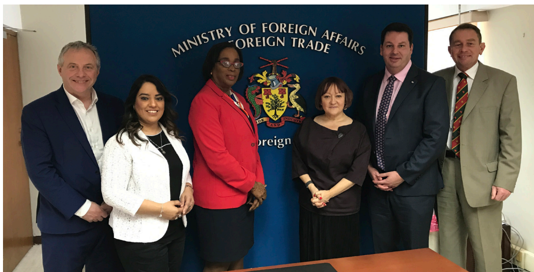
Meeting with the Barbados Minister for Foreign Trade, Hon. Sandra Husbands MP

The region has embraced the UN’s Sustainable Development Goals (SDGs), for instance by creating new “blue economy” policies which relate to SDG 14 on protecting life under water. The region is also taking action to reduce the emission of greenhouse gasses. Grenada aims to reduce 40% of greenhouse gasses by 2030