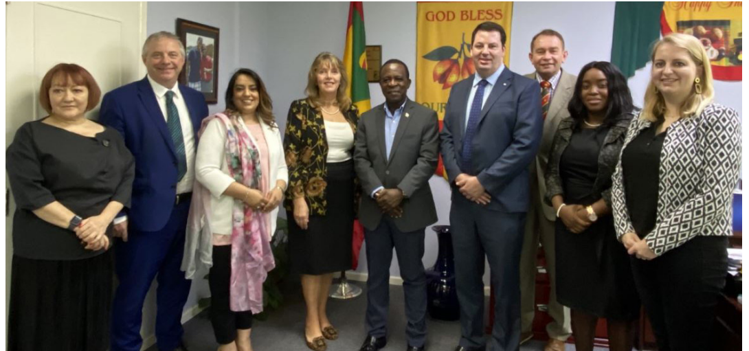
The delegation was welcomed by the Prime Minister of Grenada, H.E. Keith Mitchell

This bilateral visit to the region was the first CPA UK visit in several years. The programme provided an excellent opportunity to strengthen relations with the region, particularly on areas such as trade, climate change, security and social issues.