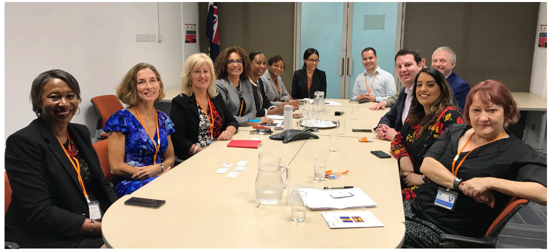
Meeting with representatives of the Barbados International Business Association

4. To communicate the work of CPA UK and the Commonwealth within Westminster, across UK and internationally to enhance the profile of the Houses of Parliament, the Commonwealth, the CPA and CPA UK.