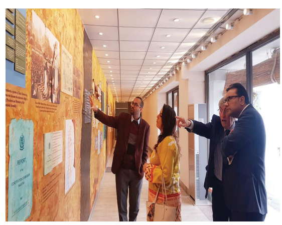
Delegates pay a visit to Gali-e-Dastoor (Constitution Gallery) in Parliament House.

The delegation also had an opportunity to meet with members of the Women's Parliamentary Caucus and the UK-Pakistan Parliamentary Friendship Group. The Women's Parliamentary Caucus has recently focused its work on minority rights, transgender rights, and empowering women in Parliament. Though it was agreed that women's equality remains a significant challenge across the country, it was equally acknowledged that more and