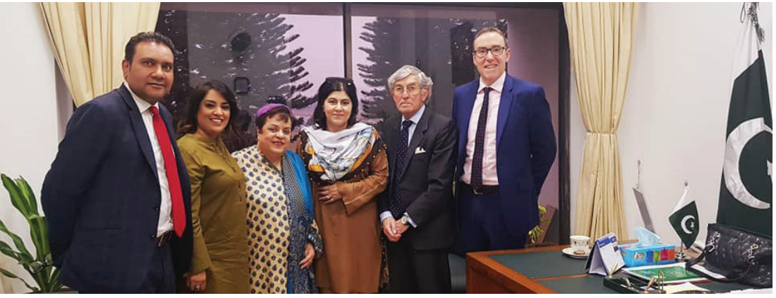
Delegation called on the Minister for Human Rights, Dr. Shireen Mazari

In a meeting with the Special Assistant on Accountability, Barrister Mirza Shahzad Akbar, it was highlighted that the government is taking measures to strengthen anti-corruption establishments at the provincial level so that they are able to handle procedural corruption cases, while the National Accountability Bureau (NAB) can focus on high-end corruption cases. An Asset Recovery Unit has also been established in