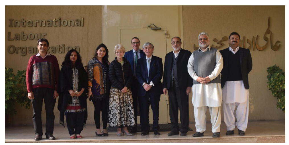
CPA UK delegation meets with the ILO team in the Pakistan Country Office in Islamabad