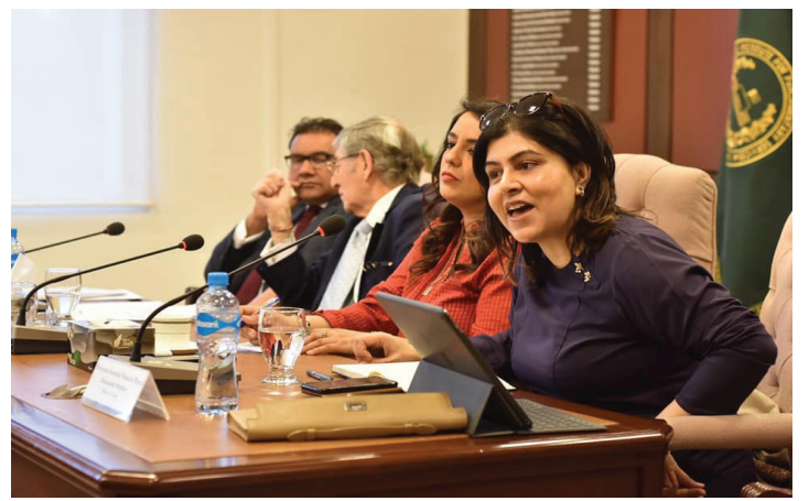
Delegates leading the Induction Programme at PIPS

The induction programme took place on 20 and 21 February at the Pakistan Institute for Parliamentary Services (PIPS) in Islamabad. Fifteen newly-elected Members of the National Assembly (MNAs) participated in interactive discussions over the course of two days, reflecting on various challenges they face both in their roles and in Parliament as a whole.