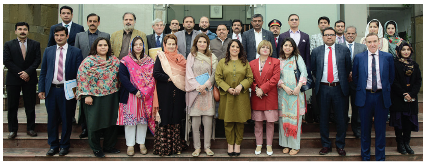
Group photo with Members of Parliament and PIPS staff at the end of the Induction Programme

CPA UK is hopeful that the newly-elected Members will work on the suggested recommendations outlined below. Steps will also be taken to design programmes and activities in accordance with the priorities and objectives of the Parliament of Pakistan. Participants were encouraged to maximise on opportunities available in the Commonwealth, as this would help them play a more effective role in strengthening and promoting democratic values and best parliamentary practices.