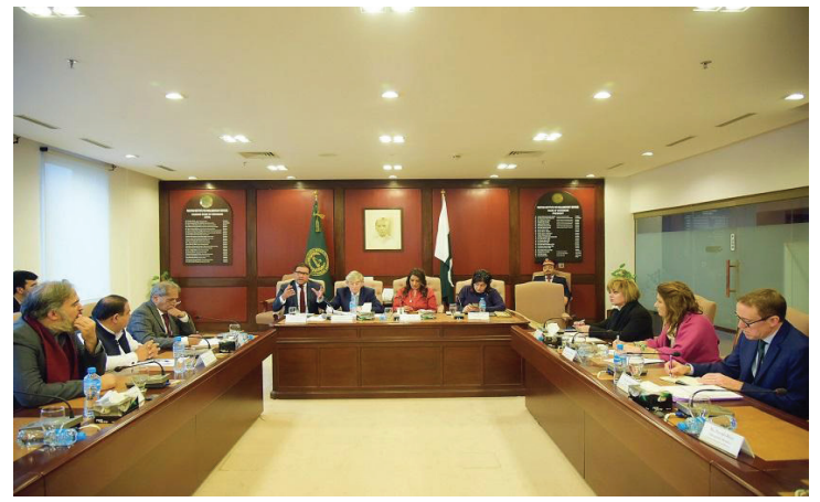
Interactive session with participants during the Induction Programme

For many Members, conflict of interests usually presents a significant