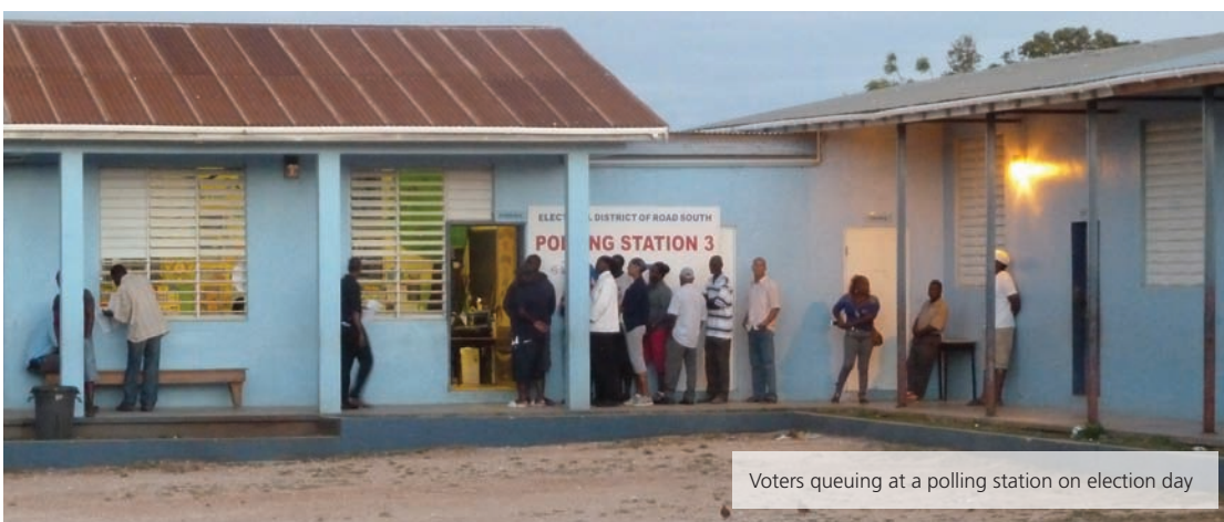
Voters queuing at a polling station on election day