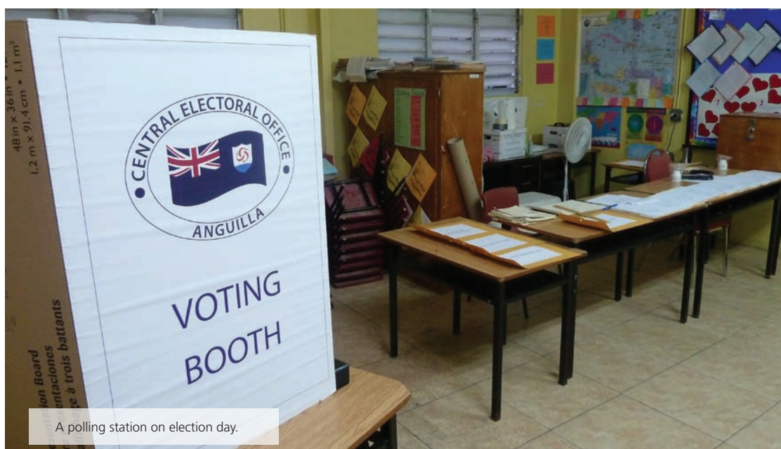
A polling station on election day.

Treating of voters before or during the election in exchange of votes is illegal. Yet the law fails to define what constitutes treating. For instance does the financing by political contestants for transportation of Anguillans living abroad to travel to Anguilla to vote (which is a rampant allegation in Anguilla) constitute treating? In order for this offence to be effective the law needs to be amended to clearly clarify what constitutes treating.