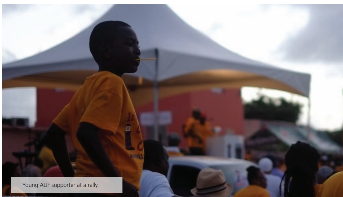
Young AUF supporter at a rally.

According to the 2011 census, 13,572 people resided on the island. Given that the number of registered voters for these elections was 10,908, it is clear that a significant number of Anguillans currently abroad were included on the list. While such persons may well be eligible, the manner in which registrations were conducted, together with the scale of such registrations, does raise concerns. At present the requirement for residency and to be domiciled are applied in a very liberal manner, and Registration Officers appear to take each registration at face value unless an objection is raised. Further, for these elections, as for previous polls, it seemed to be a common practice for political parties to visit neighbouring islands and beyond and then submit registration forms en masse on behalf of individuals living abroad. Such practices, which have been left unaddressed by both of the main parties while in government, exposes the process to abuse and need to be addressed. Considering that some seats in Anguilla are won (and lost) by a few votes the issue of “imported voters” needs to be dealt with as a matter of urgency. Given the nature of Anguillan society, a lot of people do move abroad for work, so a consensus needs to be reached as to what constitutes eligibility for voter registration in the country, so that the issue does not bedevil future polls.