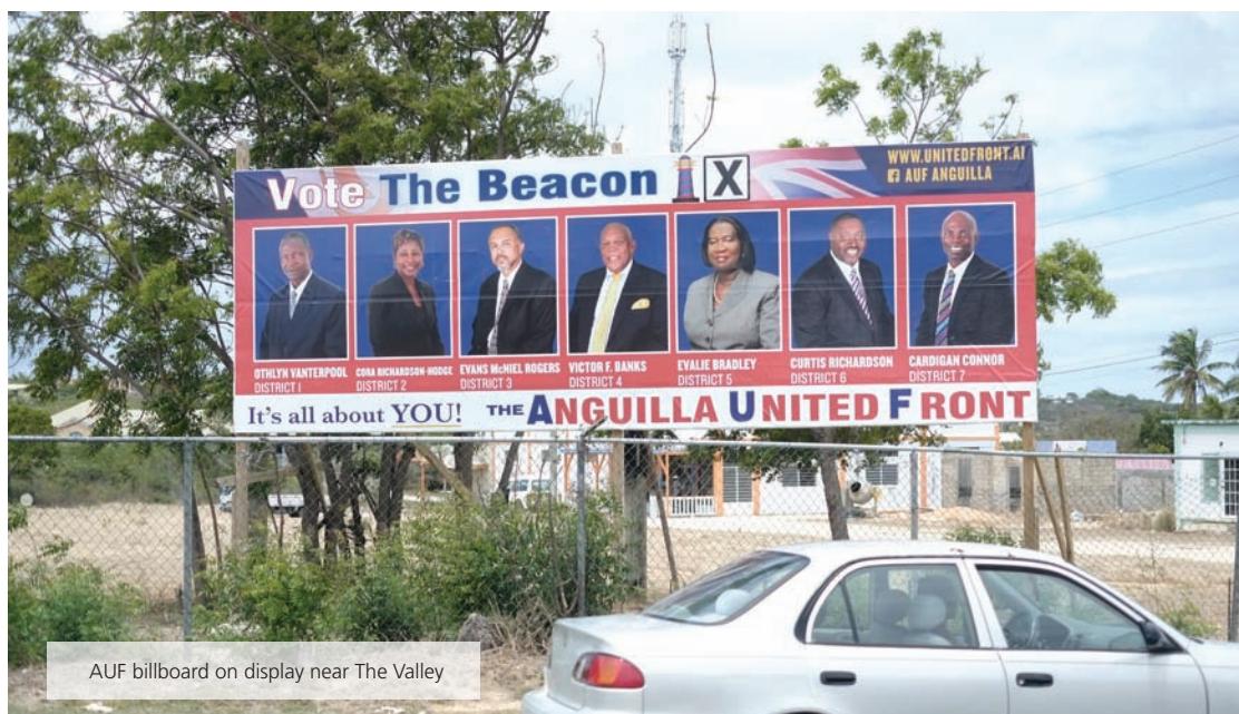
AUF billboard on display near The Valley

The Supervisor of Elections appoints a Registration Officer for the purpose of voter registration. 4 The Governor, on the recommendation of the Supervisor of Elections, appoints a Returning Officer for each Electoral District. 5 Returning Officers are responsible for the nomination of candidates as well as the management of the voting and counting in their respective district. Presiding Officers and Poll Clerks are appointed, subject to approval of the Governor, by the Supervisor of Elections. 6