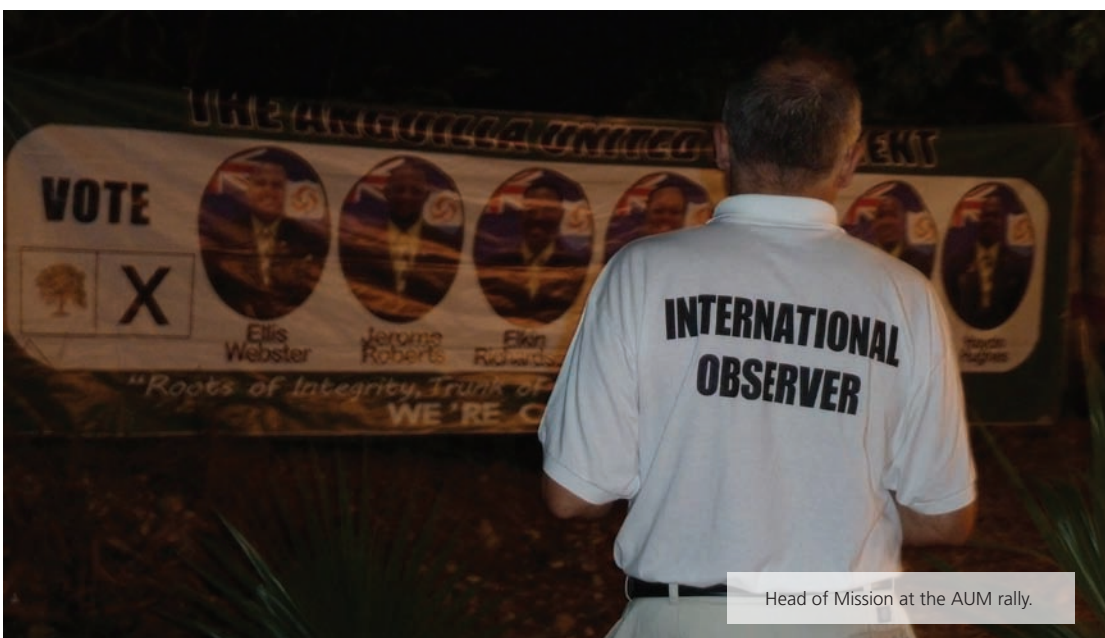
Head of Mission at the AUM rally.

The Voter register was inclusive and the right to vote was guaranteed. Regretfully the Final Voters Register was only published two days before the election which was far too late. Efforts should be made so that in future elections the Voters Register is finalised and published in adequate time before the election.